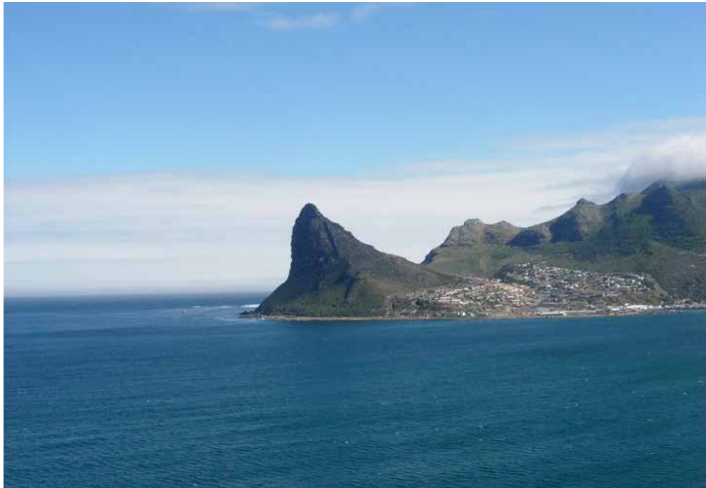
The coast, close to Cape Town