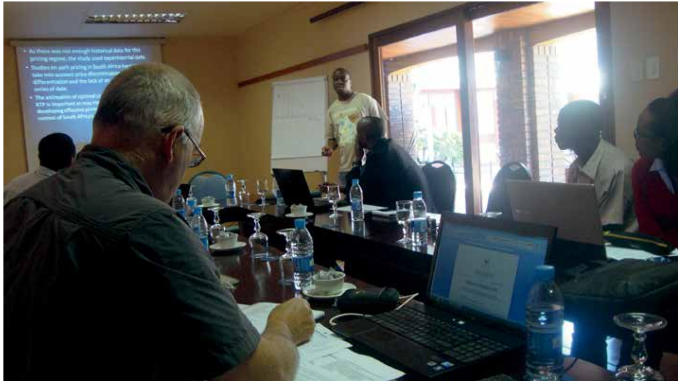
Park Pricing Workshop Kruger National Park