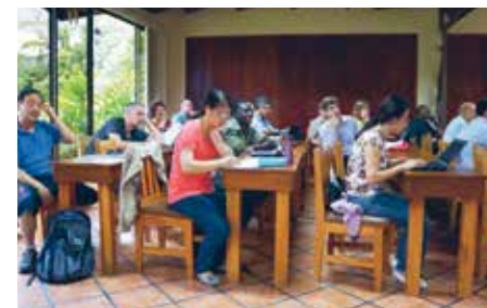
Participants in the 6th annual EfD meeting