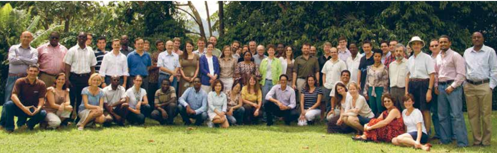
The 6th Annual Meeting of the Environment for Development (EfD) Initiative took place in La Fortuna, Costa Rica, between October 25 and 29, 2012. More than 70 people participated.