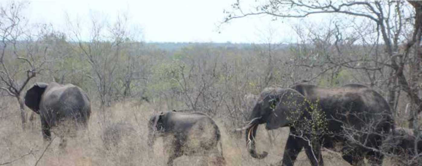
Elephants in connection to the Park Pricing Workshop Kruger National Park