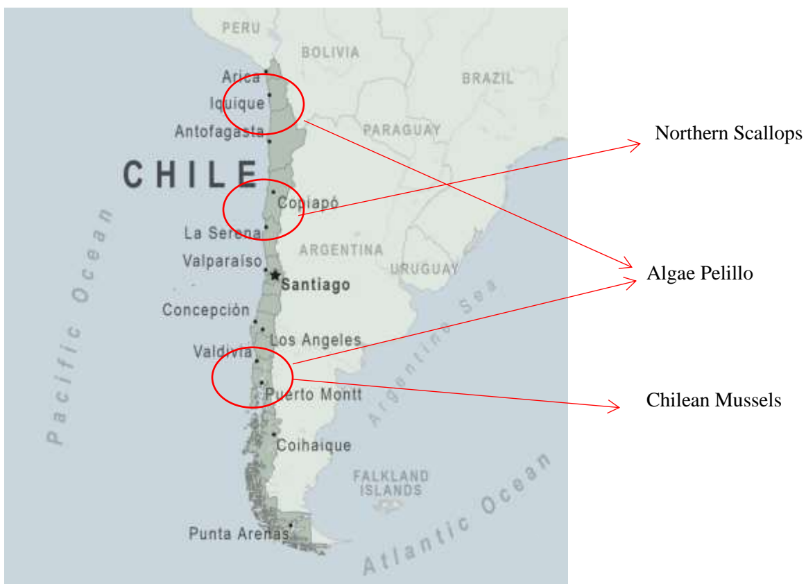
Figure A.1. The Chilean Cases: Aquaculture Production of Mussels, Algae, and Northern Scallops