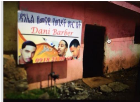
A small businesses in rural Ethiopia

Both qualitative (descriptive) and quantitative data analysis methods were used to analyse the data. In what follows, we present the results in brief.