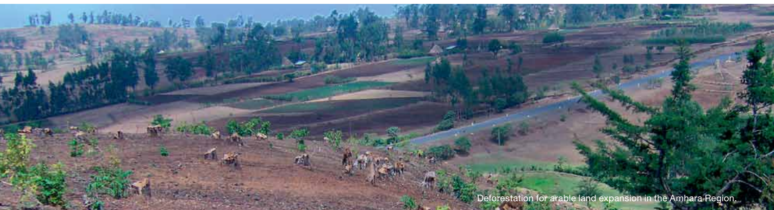
Deforestation for arable land expansion in the Amhara Region.