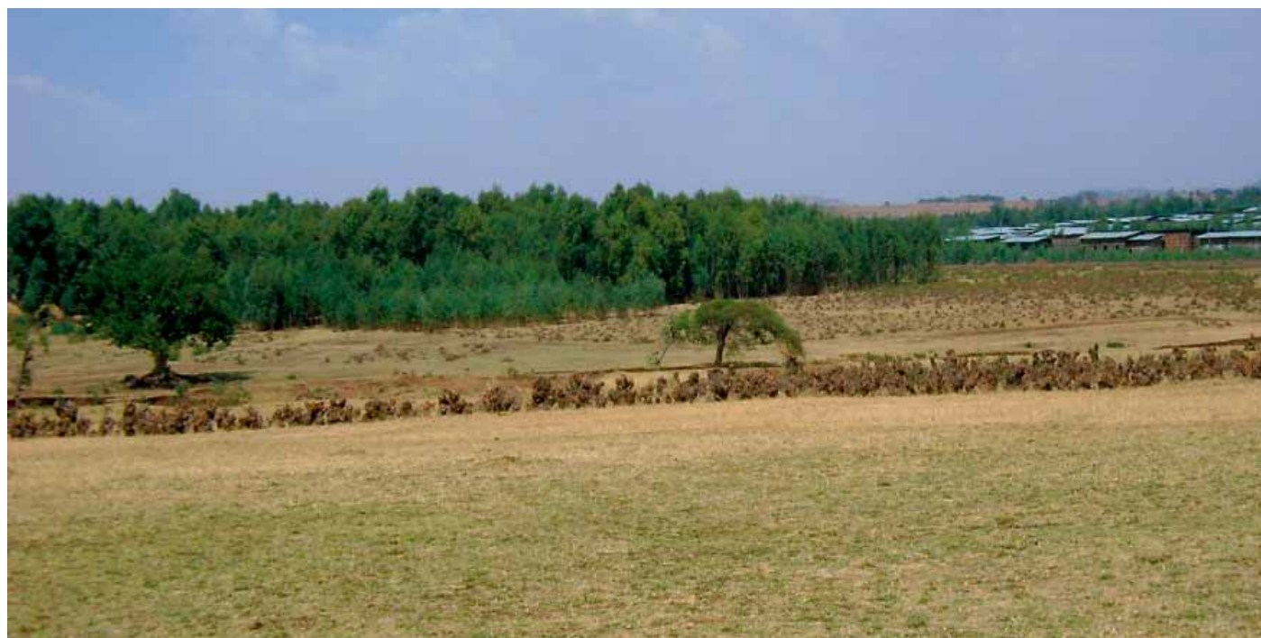
Forest, Eucalyptus trees