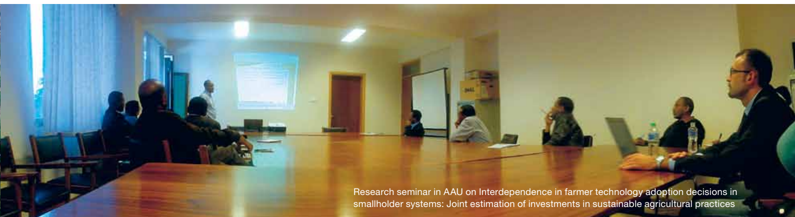
Research seminar in AAU on Interdependence in farmer technology adoption decisions in smallholder systems: Joint estimation of investments in sustainable agricultural practices