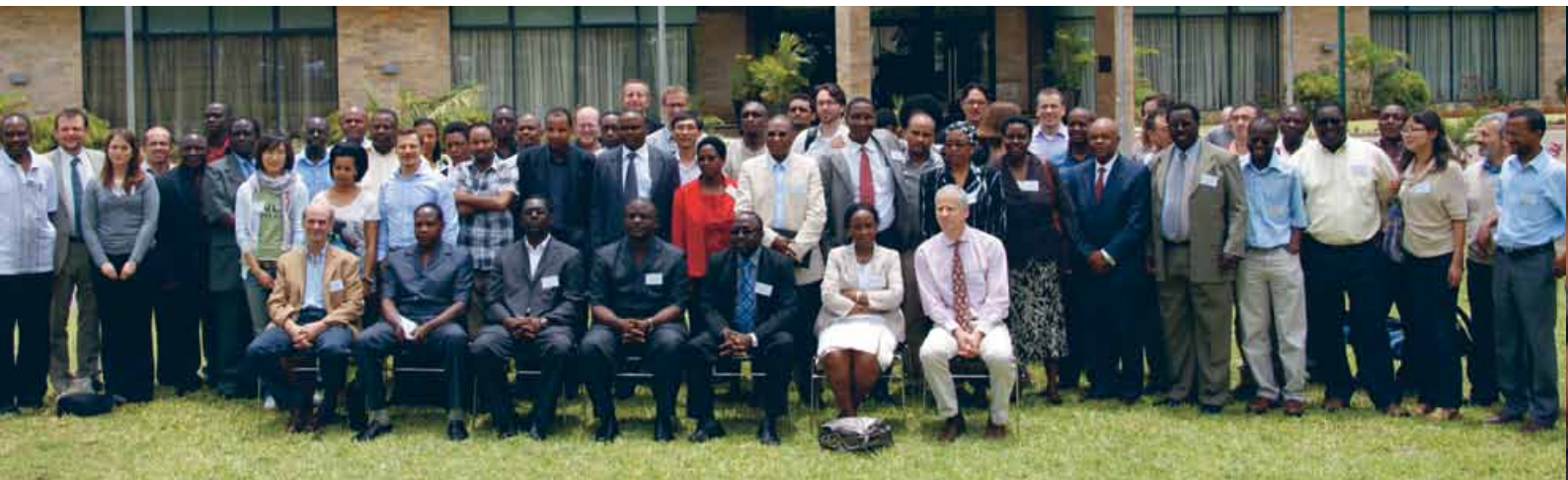
The EfD Policy Day 2011 in Arusha, Tanzania, brought together more than 80 researchers and policy makers in a dialogue on Opportunities for sustainable natural resource use with national and local benefits.