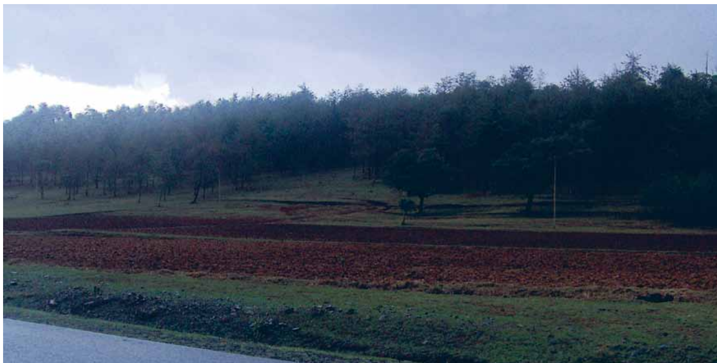
Community kept forest (Junipers)

Efd Ethiopia Center Report 2010 This report presents Efd Ethiopia/Environmental Economics Policy Forum for Ethiopia, its members and work during 2010. For a free hardcopy, please send an email to: info@efdinitiative.org