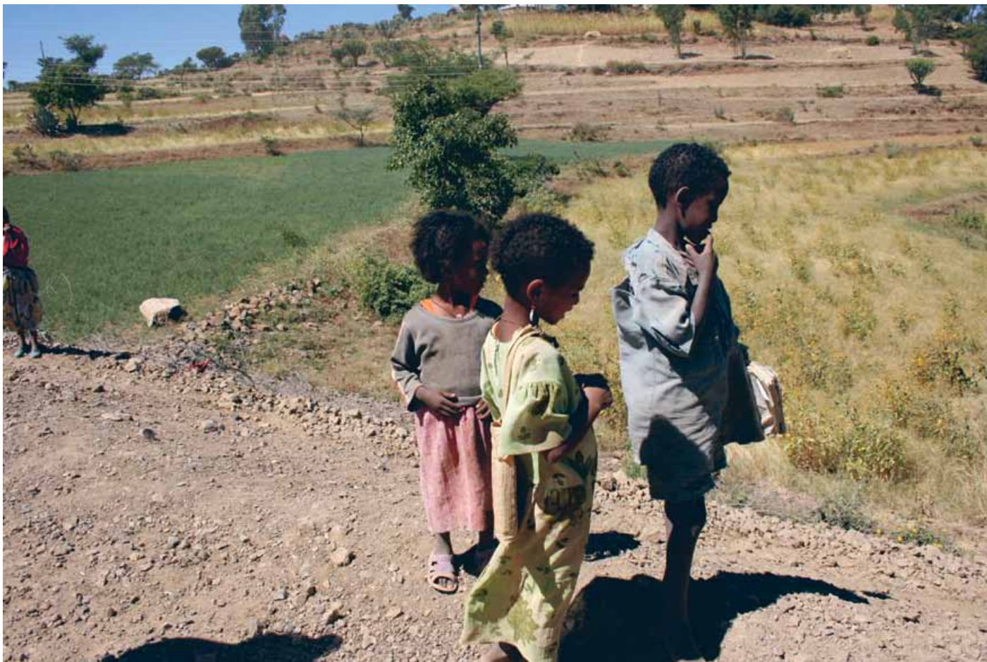
Children on their way to the small town of Adwa in northern Ethiopia (Tigray region).