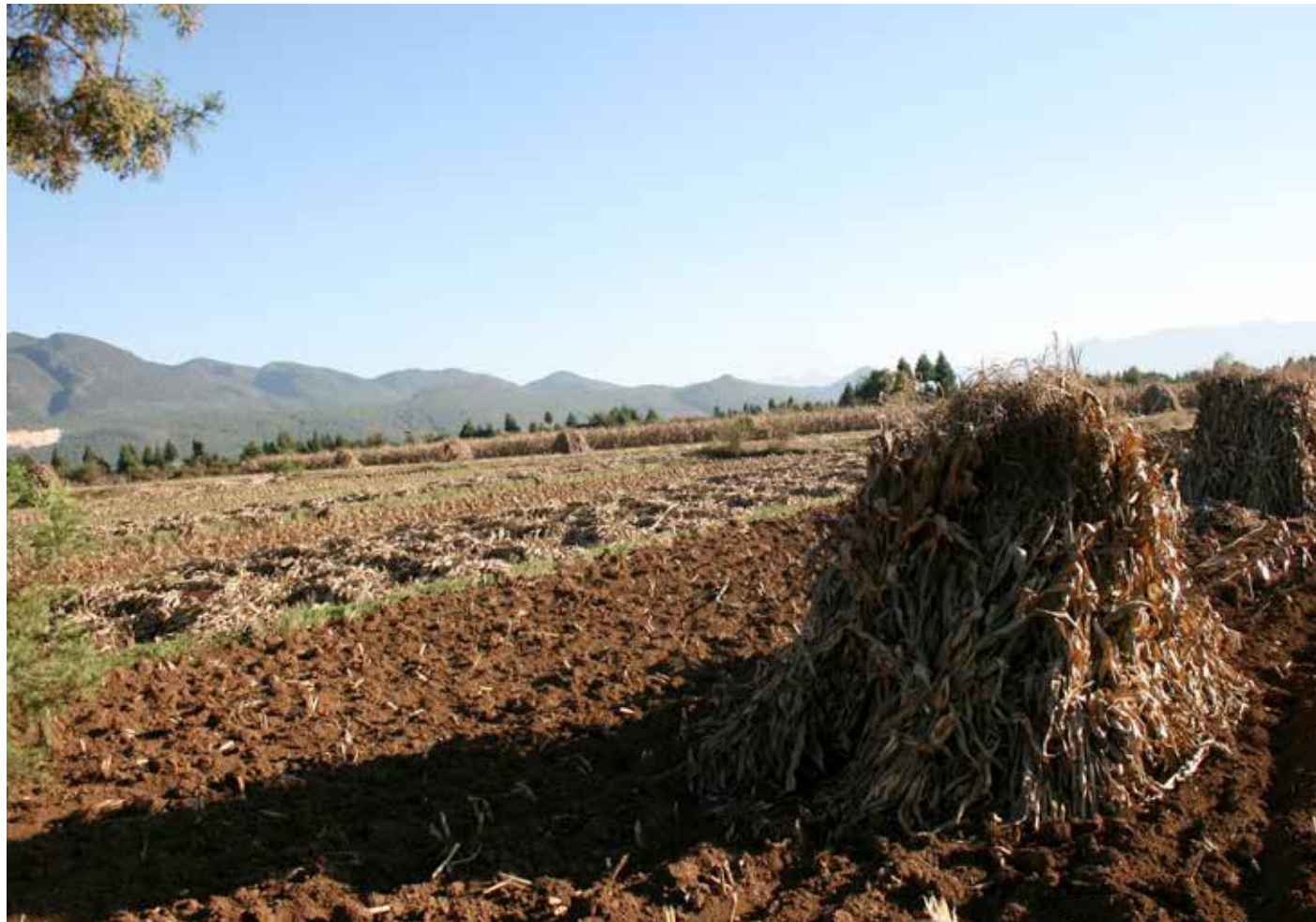
Corn cultivation in the province of Yunnan, near the city of Lijiang