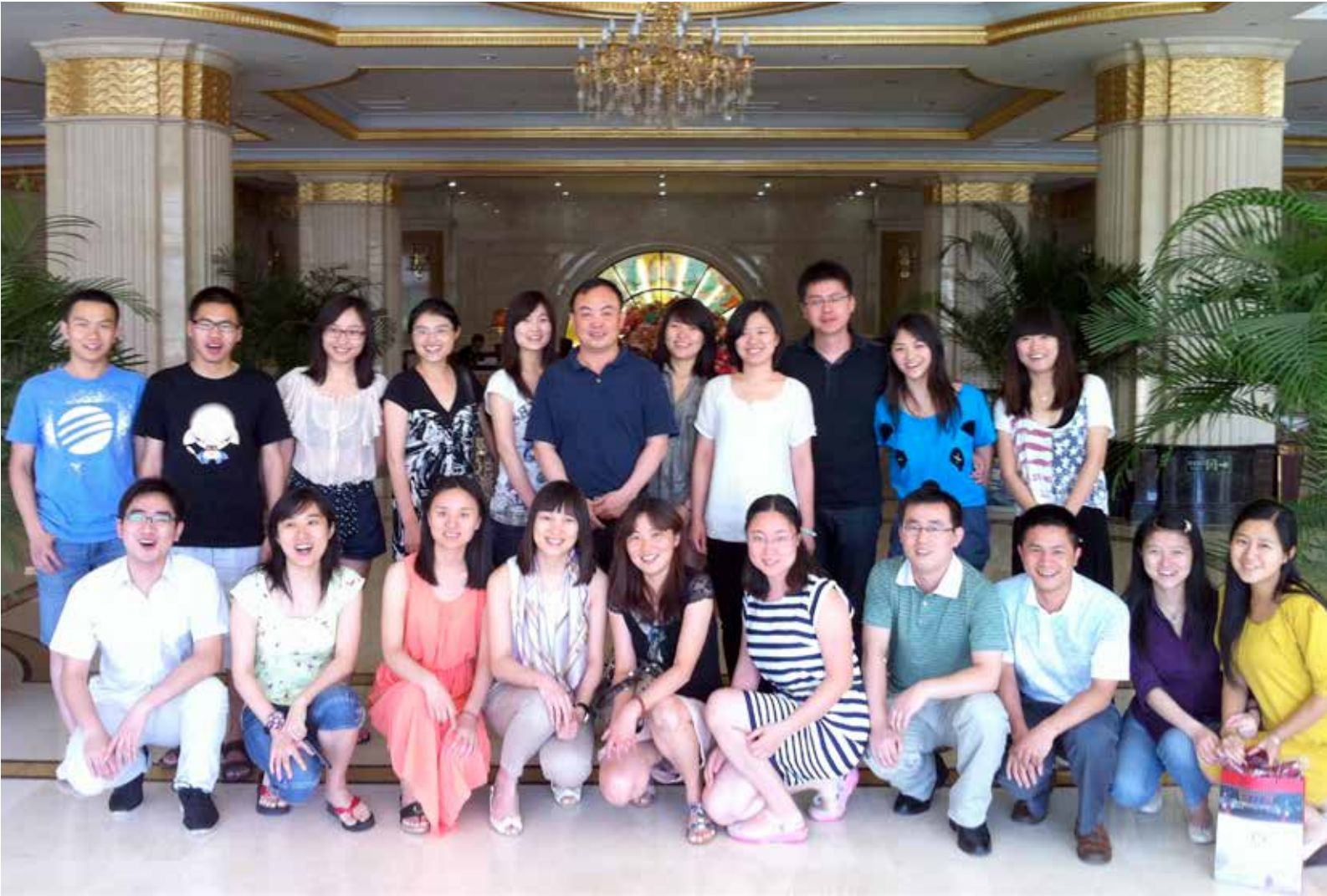
A picture of EEPC/EfD China

More details about each person are available on the EfD website, in the "Centers" section for China. www.efdinitiative.org/centers/China