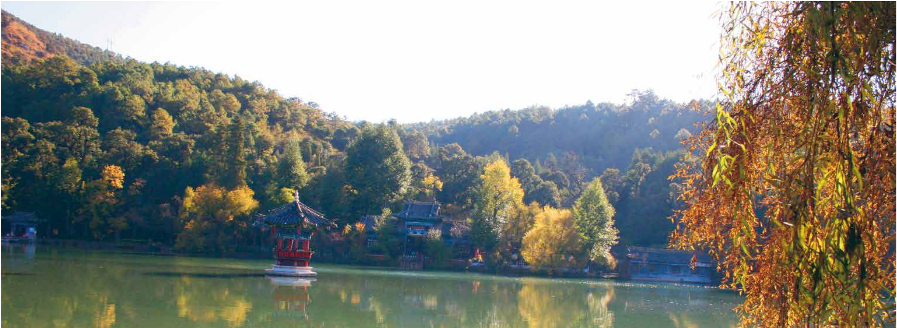
View over a lake in the city of Dali, in the province of Yunnan

During 2012, EEPC received both financial and organizational support from the EfD Initiative, the World Bank, the State Forest Administration of China, and the Ministry of Environmental Protection (MEP). During the six years since the founding of EEPC, we have also received extensive support from the Ford Foundation, Forest Trend, the Rights and Resources Group, the International Institute for Environment and Development (IIED), the International Development Research Center (IDRC), the National Natural Sciences Foundation of China (NSFC), and others.