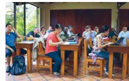
Participants in the 6th annual EfD meeting