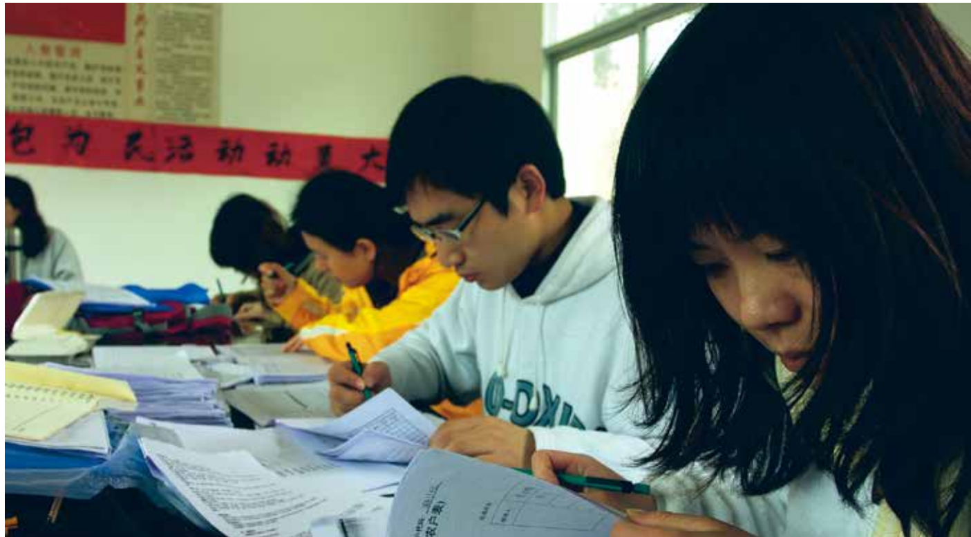
Students participating in a survey held by EFD